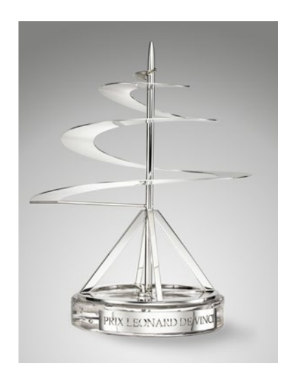
Trophy for the Leonardo da Vinci Prize © ALL RIGHTS RESERVED