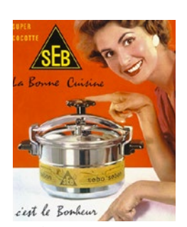
SEB's Super-Cocotte pressure cooker