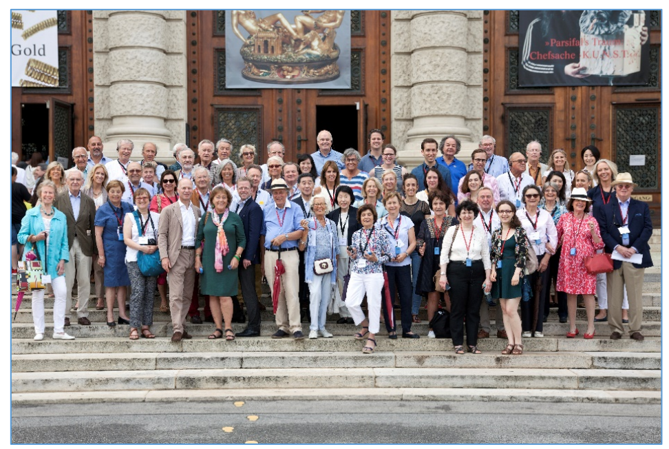
The Hénokiens: 2017 Annual Conference, Vienna, 23 June 2017